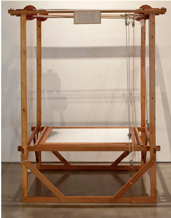
“Drawing Drawing Machine”, 1970, wood, steel, lead, glass, cotton cord, copper and salt, 54 x 44 x 44 inches

(1970), May’s rope-and-pulley operated re-make of the Etch A Sketch toy, allows visitors to move a lead weight across a shallow salt-filled platform to make line drawings. An inveterate scavenger, May seems able to create art from almost any object that falls into his grip. In his restoration of a sailboat, Robinson Crusoe 1975, May pasted the entire text of Daniel Defoe ’s novel to the interior and exterior of the craft with layers of resin; it hangs upside down from the ceiling, suspended by ropes a few feet above the floor, a monument to perseverance.