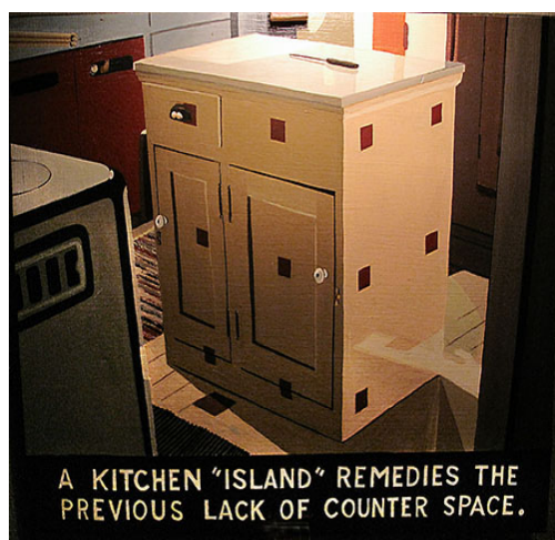
A KITCHEN "ISLAND" REMEDIES THE PREVIOUS LACK OF COUNTER SPACE.