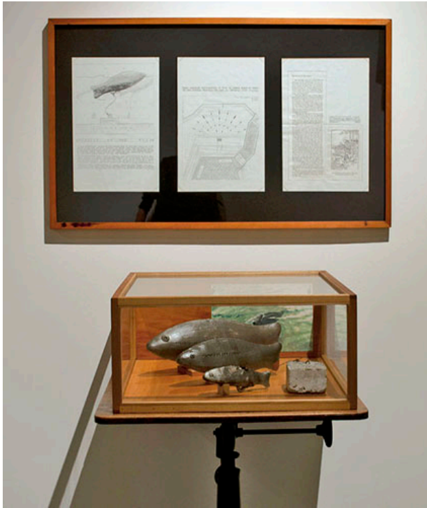
“Miracle of the Fishes (remnants)”, 1978, ceramic, wood and glass, dimensions variable