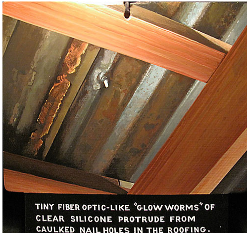
TINY FIBER OPTIC-LIKE "GLOW WORMS" OF CLEAR SILICONE PROTRUDE FROM CAULKED NAIL HOLES IN THE ROOFING.