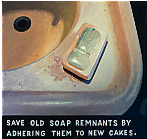
SAVE OLD SOAP REMNANTS BY ADHERING THEM TO NEW CAKES.