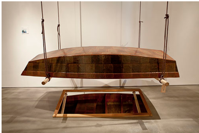
“Robinson Crusoe”, 1975, wood and mixed media, 8 x 3.5 x 4 feet

May’s low-tech, DIY ethos isn’t so much a protest as it is a plea for reverence — for things that are either extinct or are well on their way to becoming so. Books, for example, May hollows out and repurposes as lamps to illuminate several paintings, bringing to mind words a schoolmarm might have used to chastise a dimwitted student: “Turn on the lights!” My Darned Sweater , a garment preserved under glass (and redolent of mothballs), carries a note stating that its previous owners – the artist’s mother and grandmother – “would have continued to repair it indefinitely